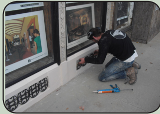
Above: Decorative grating added to facade