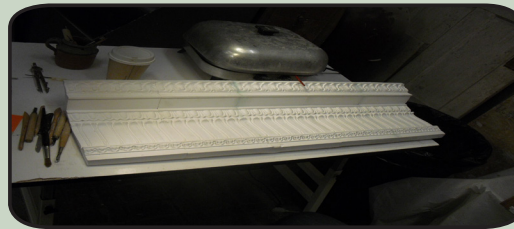
Below: Ticket Booth Molding