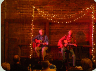
Below: Backstage concert series