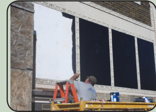
Above: Transom window touchup