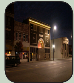
Right: Cornice lighting for the first time in 60 years