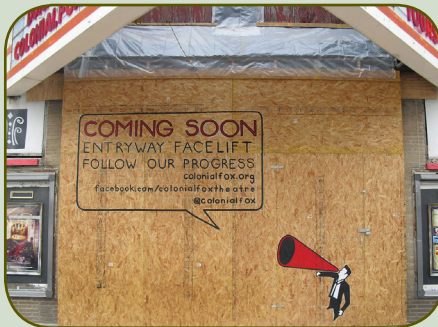
The Fox gets a face lift!