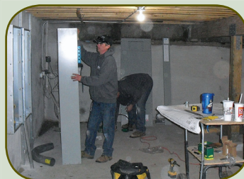
Electrical work begins