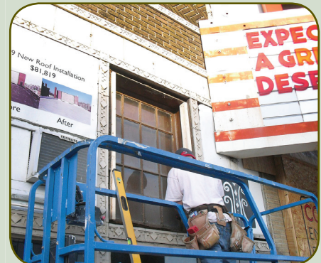
New Window infill installation on East façade begins