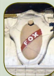
BELOW & LEFT: Revealing historic details of the ticket booth