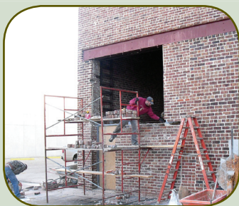
Heikes masonry begins back wall infill and west door frames are installed