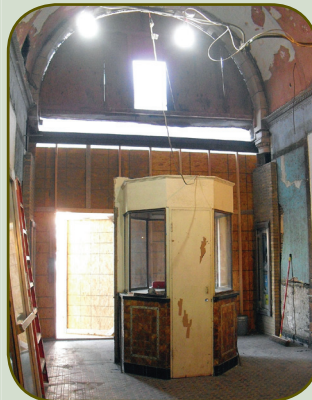
ABOVE: view from dening the hoarding wall