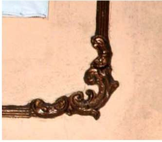
An architectural detail from inside the Colonial Fox Theatre.

“It was as if she (Stilwell Hotel) Had died and nobody cared.”