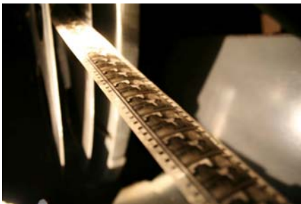
The Victoria 18 projector in the Colonial Fox theatre still has film waiting to run!

“It was as if she (Stilwell Hotel) Had died and nobody cared.”