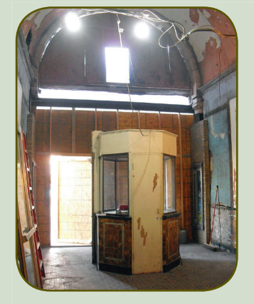
ABOVE: View from benind the hoarding wall