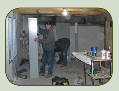
Electrical work begins