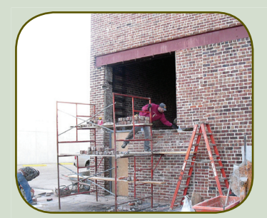
Heikes Masonry begins back wall infill and west door frames are installed