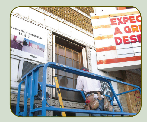
New Window infill installation on East façade begins