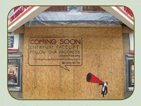
The Fox gets a face lift!